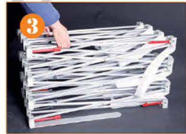
3. Open the frame up