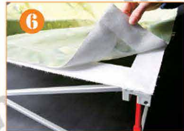
6. Put down and fix the graphic with velcro