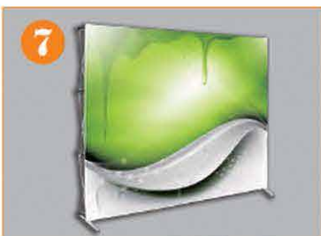
7. Frame with graphic