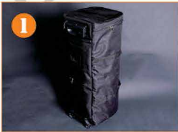
1. Case with frame