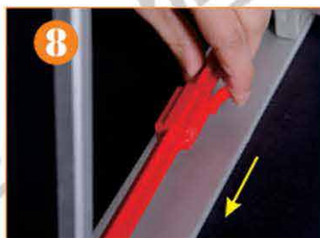
8. Remove the graphic and open the plastic connectors of the corners