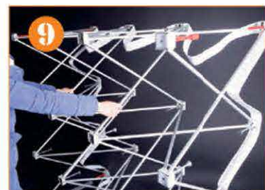
9. Close the frame and put into the case