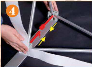
4. Fix 4 plastic connectors of the corners