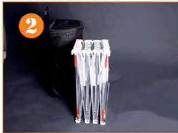
2. Take out the frame from the case